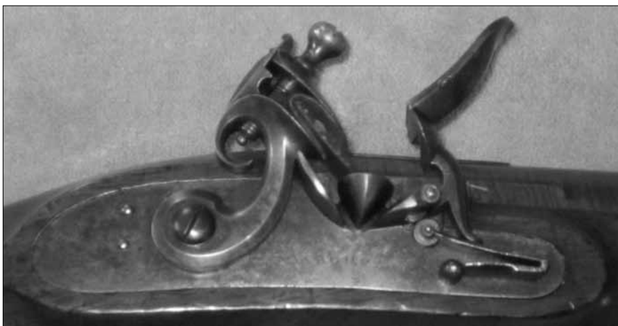
Fig. 1. Cavanagh marked lock work. Showing Roller Frizzen spring, Rain Proof Pan and Classic French Cock.

We can deduce this because The Act (Schedule B., 6&7. Vic., Cap. 74. Sec. 3) covered 34 Counties and 5 Boroughs of